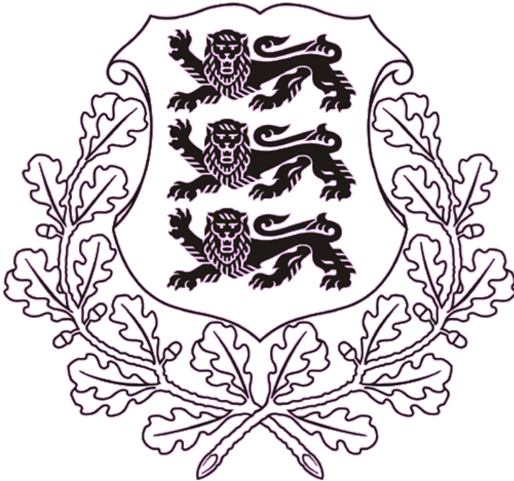
Greater national coat of arms